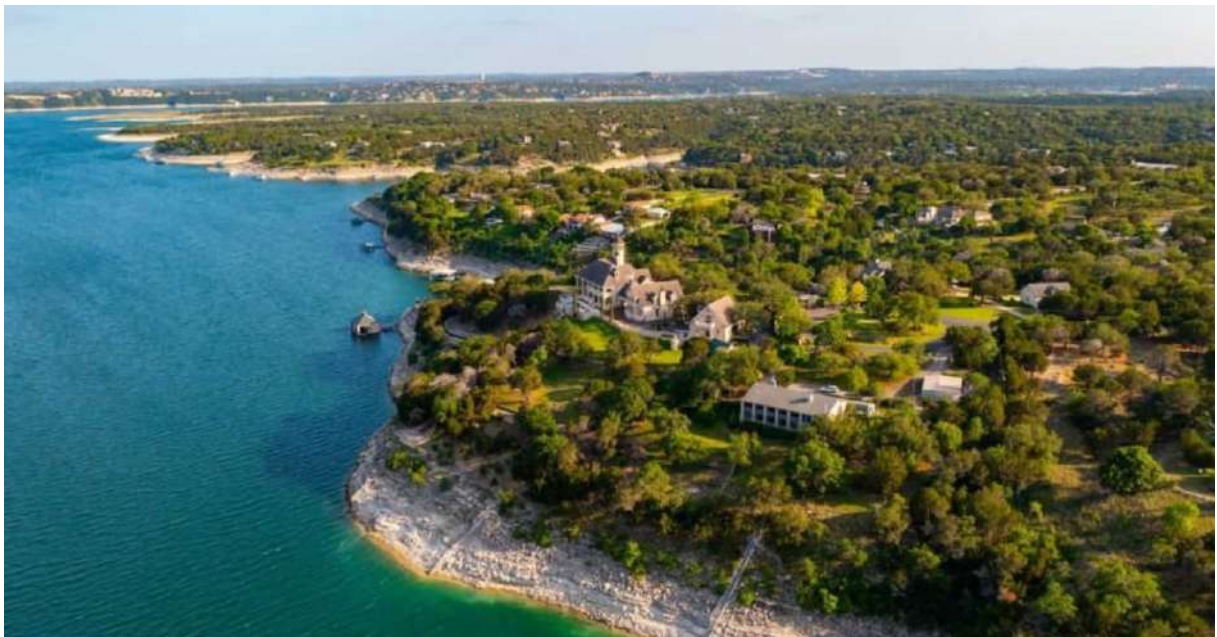
Lakeside Resort Community

Waterfront living is rare and enduring. Demand from families, retirees, and second-home buyers fuels absorption and pricing power.